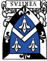
Province of St. Joseph